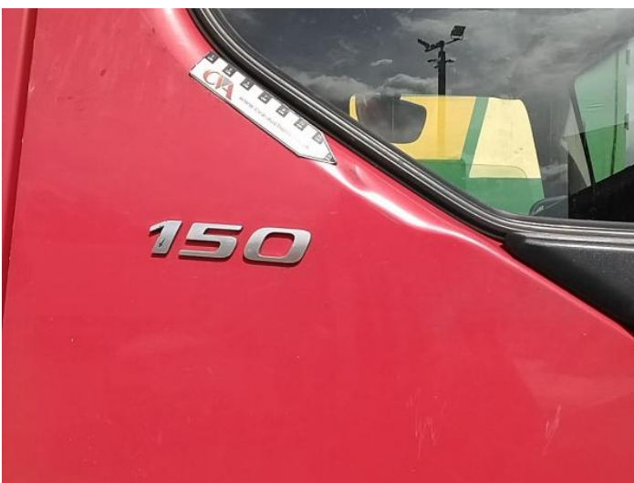
13: Door osf Dented Between 10mm + 30mm