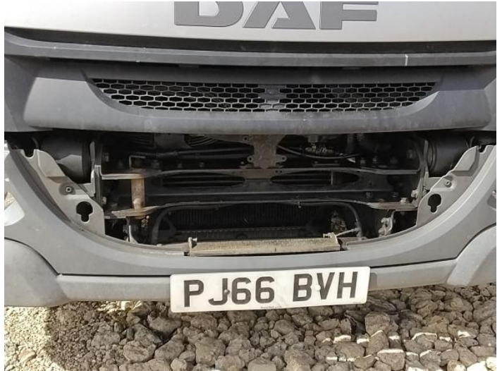
4: Grille Front Missing Replace