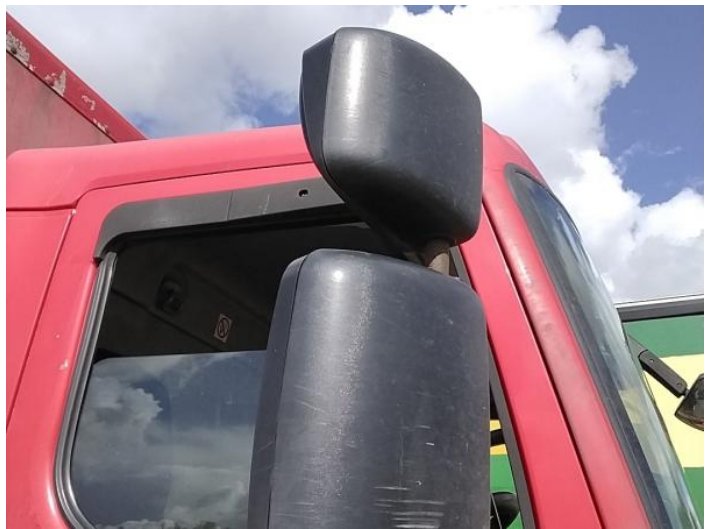
12: Door Mirror Assy osf Scuffed (Unpainted) UpTo 100mm