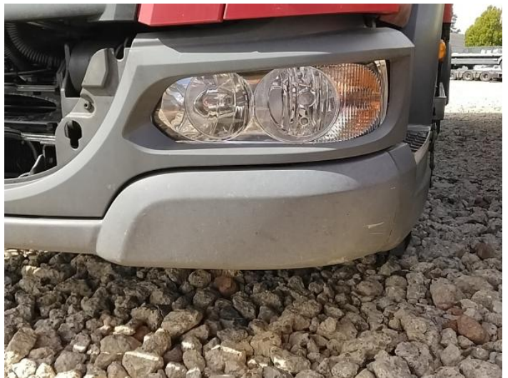
6: Bumper Front Chipped Multiple Chips