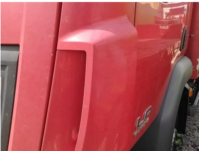
7: Wing nsf Scratched Over 25mm Not Thru Paint