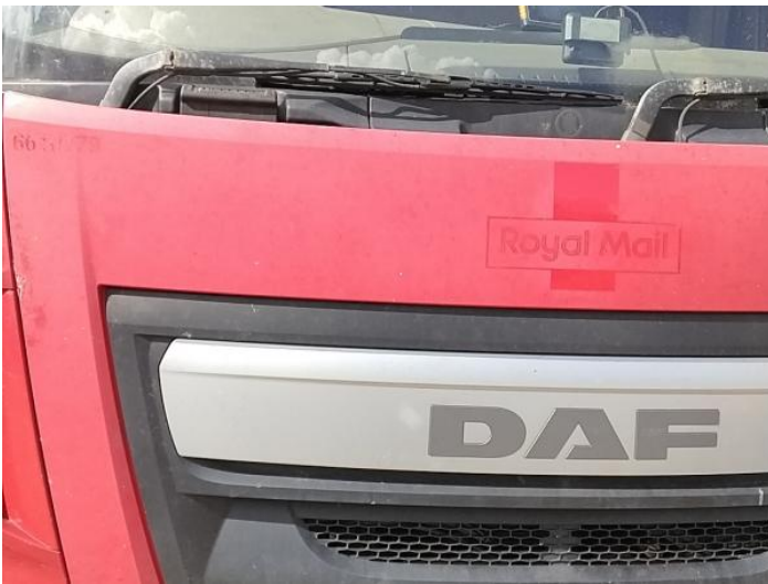
5: Bonnet Cracked Replace