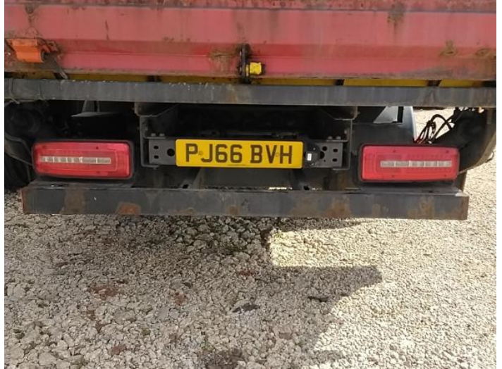
10: Bumper Rear Rusted Over 5mm