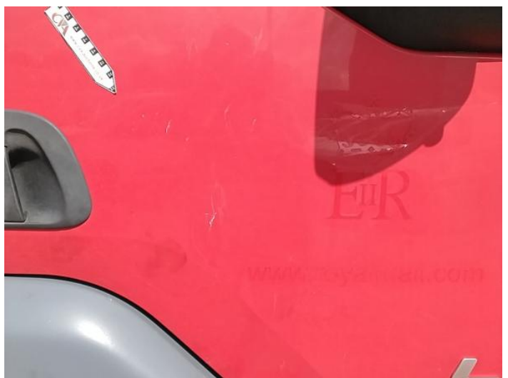
14: Door osf Scratched UpTo 25mm Thru Paint