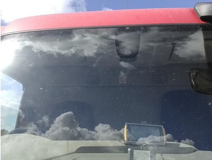
9: Screen Front Chipped UpTo 10mm