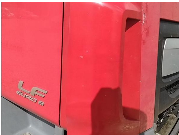
1: Wing osf Chipped Multiple Chips