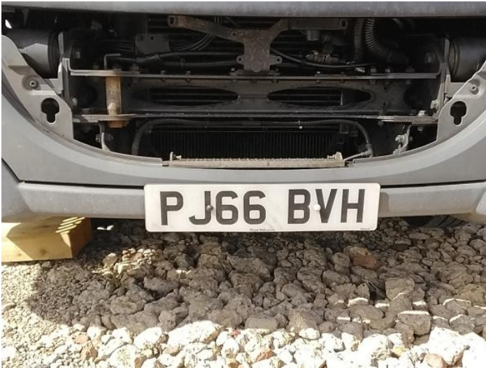
3: Bumper Front Chipped Multiple Chips