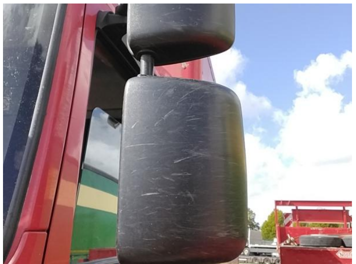
8: Door Mirror Assy nsf Scuffed (Unpainted) UpTo 100mm