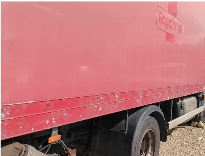
11: Qtr Panel osr Scratched Over 25mm Not Thru Paint